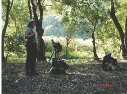
Bird watching with expert

Guests at the Jhadol Safari Resort can choose to see as well as participate in activities that will give them a taste of this unique ethnic local culture.